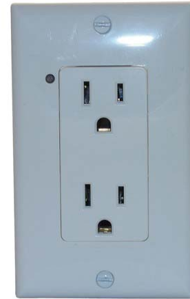
Anywhere Virtual Receptacle Outlet Remote Lighting and Appliance Control Model: URD-V0